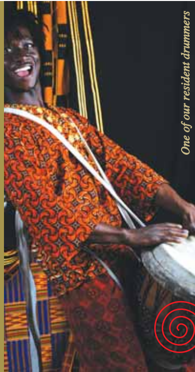
One of our resident drummers