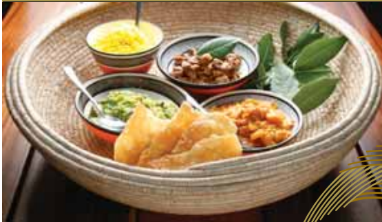
Tasting menu served at the table in baskets