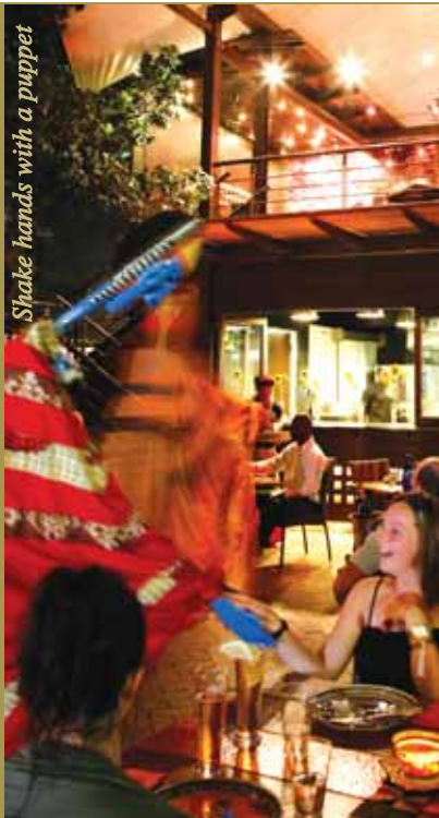
Shake hands with a puppet