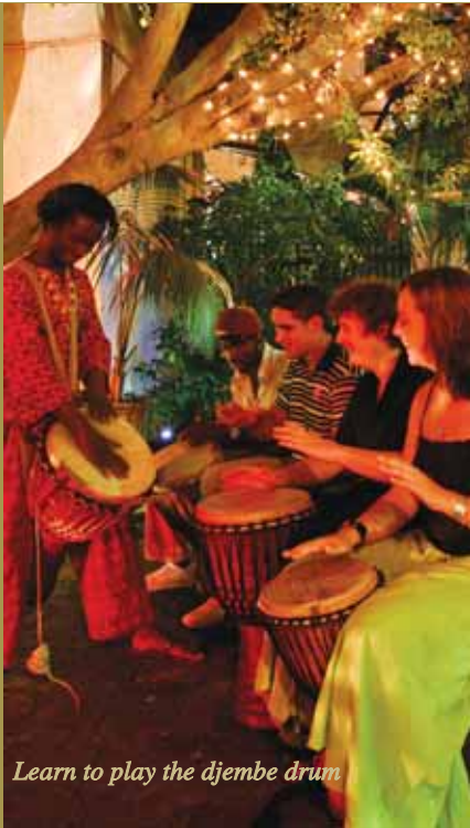
Learn to play the djembe drum