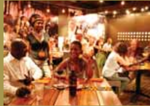
The Royal Deck