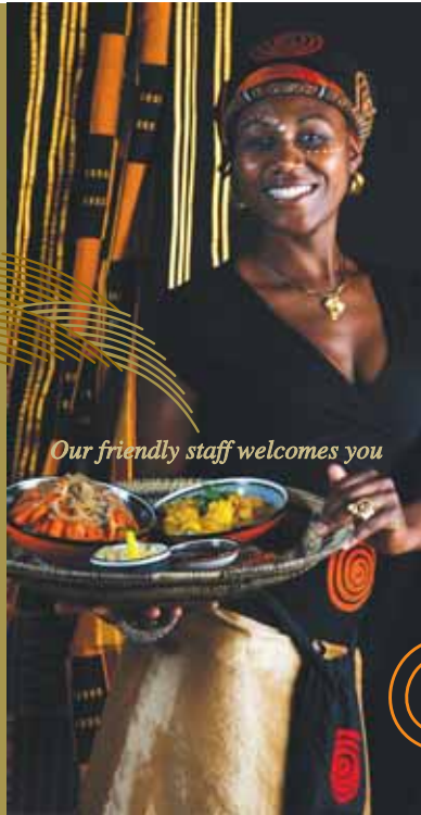
Our friendly staff welcomes you