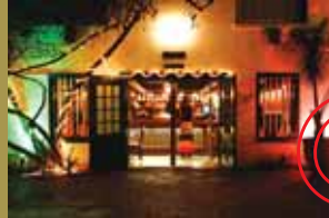
Our 230 year old cellar