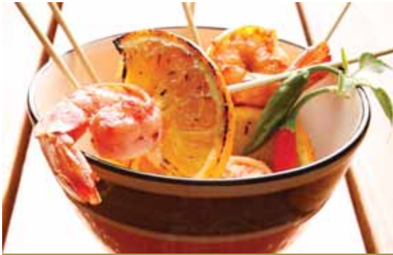
A seasonal set menu served at the tables