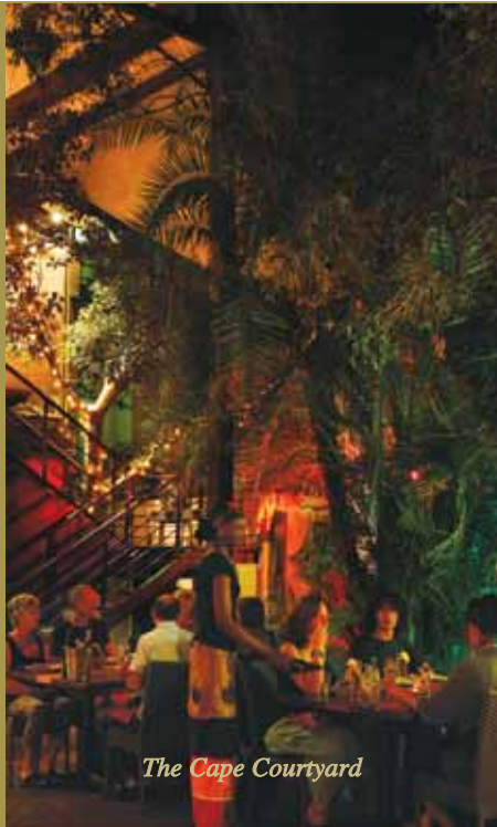
The Cape Courtyard